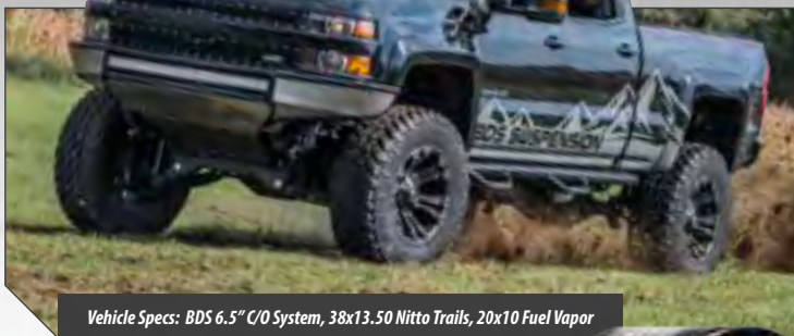
Vehicle Specs: BDS 6.5" C/O System, 38x13.50 Nitto Trails, 20x10 Fuel Vapor

2011-2016 CHEVROLET/ GMC 2500/3500HD 2WD/4WD - DIESEL