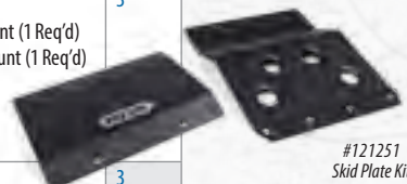
#121251 Skid Plate Kit